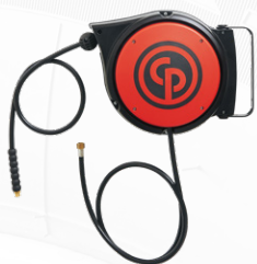
HR8108 & HR8208