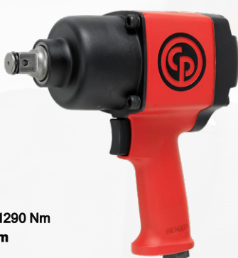
CP6773 1" 6151590410