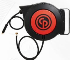
HR 8110 & HR 8210