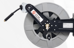
HR 9110 & HR 9113