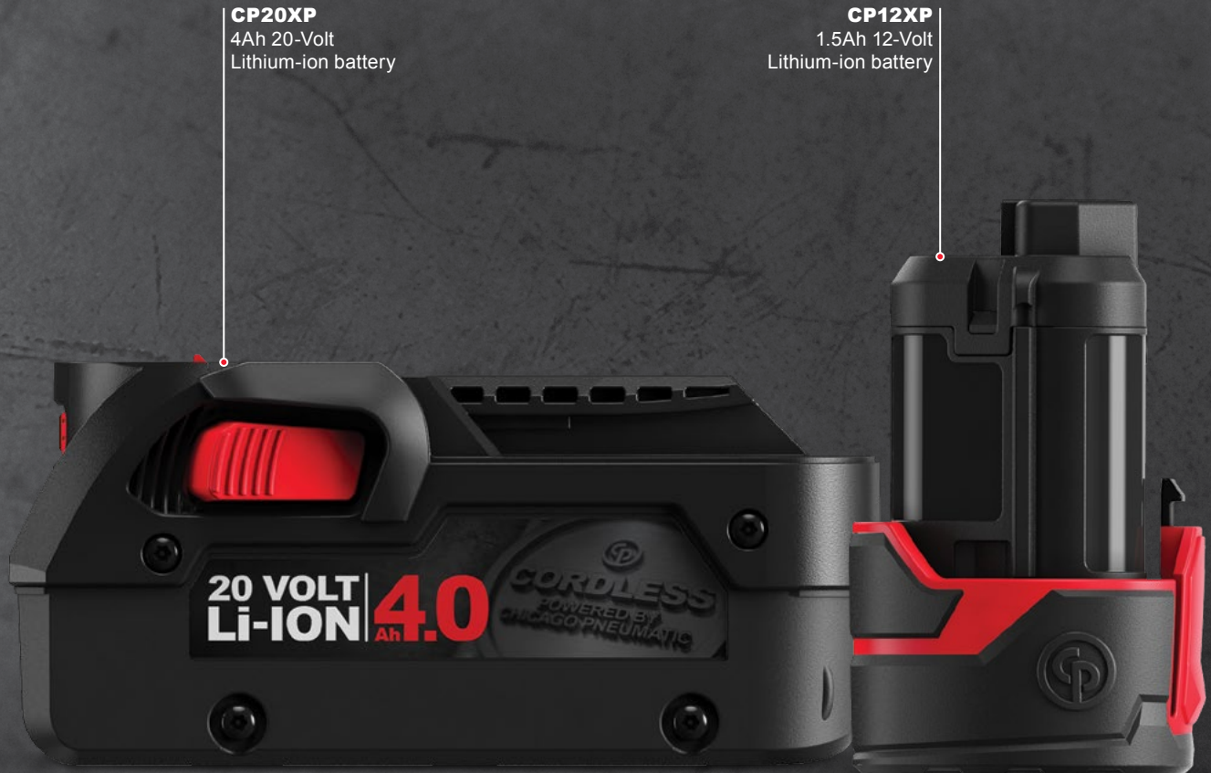
CP20XP 4Ah 20-Volt Lithium-ion battery